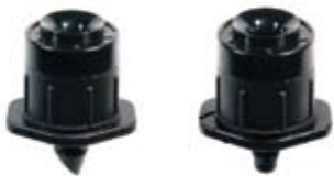
Spectrum™ Barb 0.16"