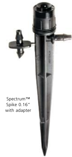
Spectrum™ Spike 0.16" with adapter