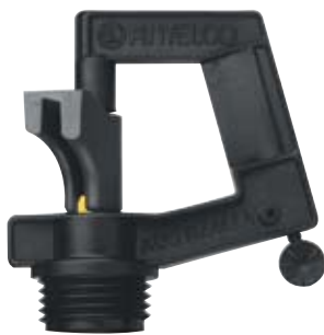
Rotor Rain® 3/8" Thread