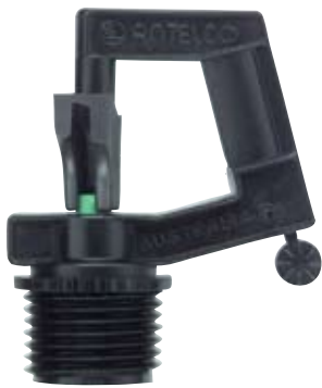
Rotor Rain® 1/2" Thread