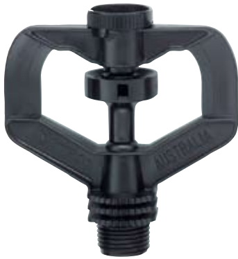
Rotor Max™ 1/2" Thread