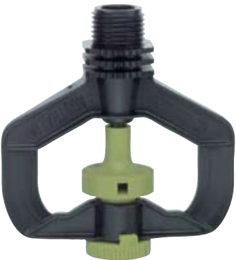
Inverted Rotor Max™ 1/2" Thread