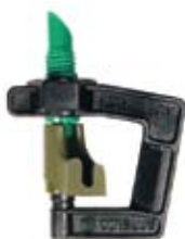
Inverted Rotor Spray™ 10-32 UNF Thread