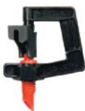
Rotor Spray™ 10-32 UNF Thread