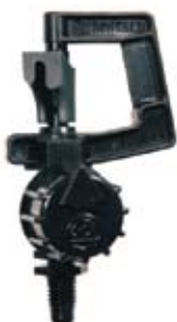
Vari-Rotor Spray™ 10-32 UNF Thread