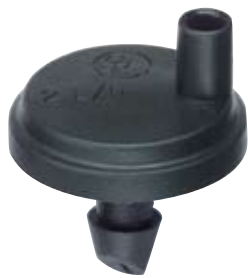
Agri Drip™ Standard Emitter