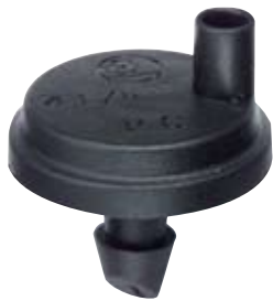
Agri Drip™ Pressure Compensating Emitter