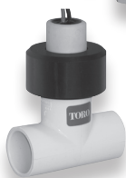
TFS Series Flow Sensor