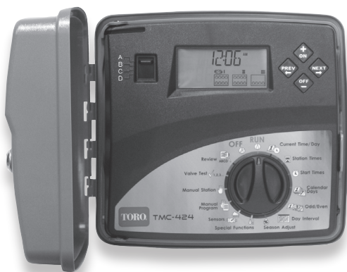
TMC-424E Modular Controller

The TMC-424E offers sophisticated features, ease of use, and advanced modular technology to provide industry-leading flexibility, performance and convenience.