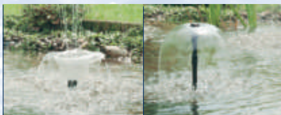
Trumpet 1/2 in.

→ Nozzles in various designs for individual fountain creation.