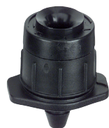
Spectrum 360™ 0.16" Barb

Suitable for a variety of landscape, nursery, pot plant and garden watering.