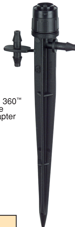
Spectrum 360™ Spike with adapter