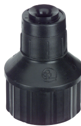
Spectrum 360™ 1/2" Thread