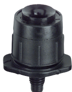
Spectrum 360™ 10-32 UNF Thread