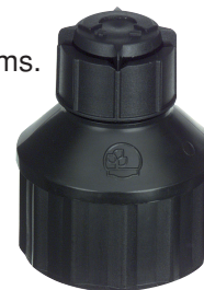
Mini Bubbler 1/2" Thread