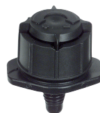
Mini Bubbler 10-32 UNF Thread