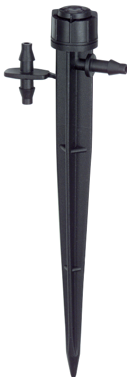
Mini Bubbler Spike with adapter

Suitable for container plants, garden beds, street trees and palms.