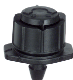
Mini Bubbler 0.16" Barb